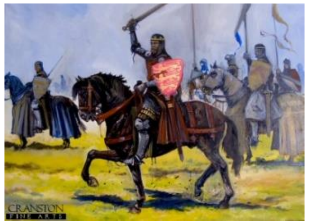
WILL YOU JOIN US?